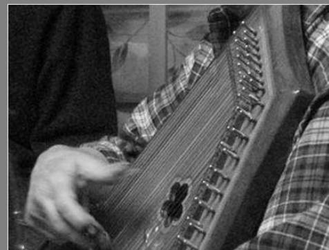
Strumming & Singing